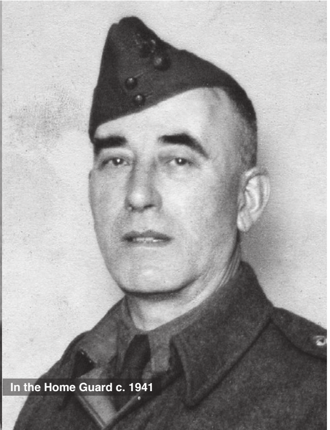
In the Home Guard c. 1941